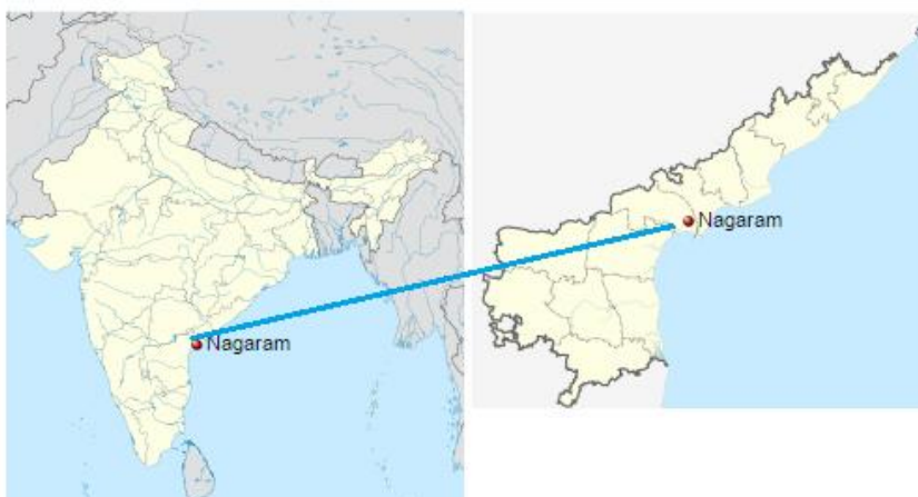
Figure 1: Location of Study area