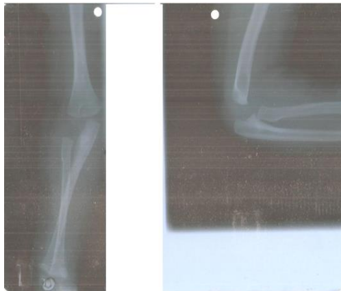
Figure-2: Female 4Years

Non ossified O.cs of the upper end of the radius